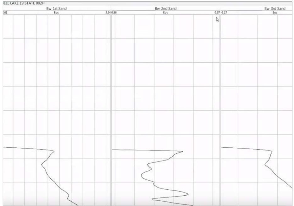
The well logs illustrate which section of the wellbore landed in zone. In this example, the middle well log shows the section that landed within the zone of interest.

to drill. Don’t waste time and money analyzing static, un-customizable reports or incomplete solutions. Identify the best opportunities with less risk, less cost, and less time by using the Identify Production by Zone workflow.